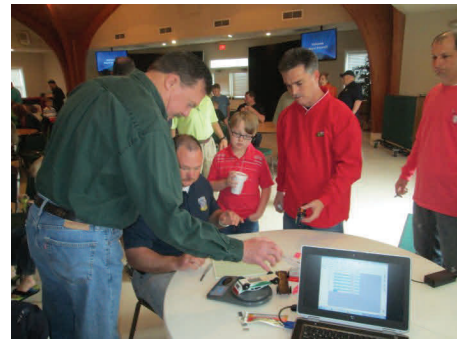
The registration process at the RA Racer Derby. See page one and four for the complete story.