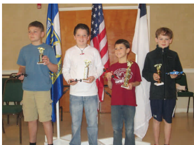
Crusaders Division Winners