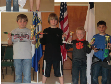
Lad Division Winners